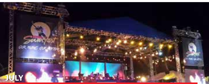
Reggae music fans gather on the grounds of Catherine Hall, Montego Bay to witness their favorite artistes deliver thrilling sets, at the Red Stripe-sponsored Reggae Sumfest.