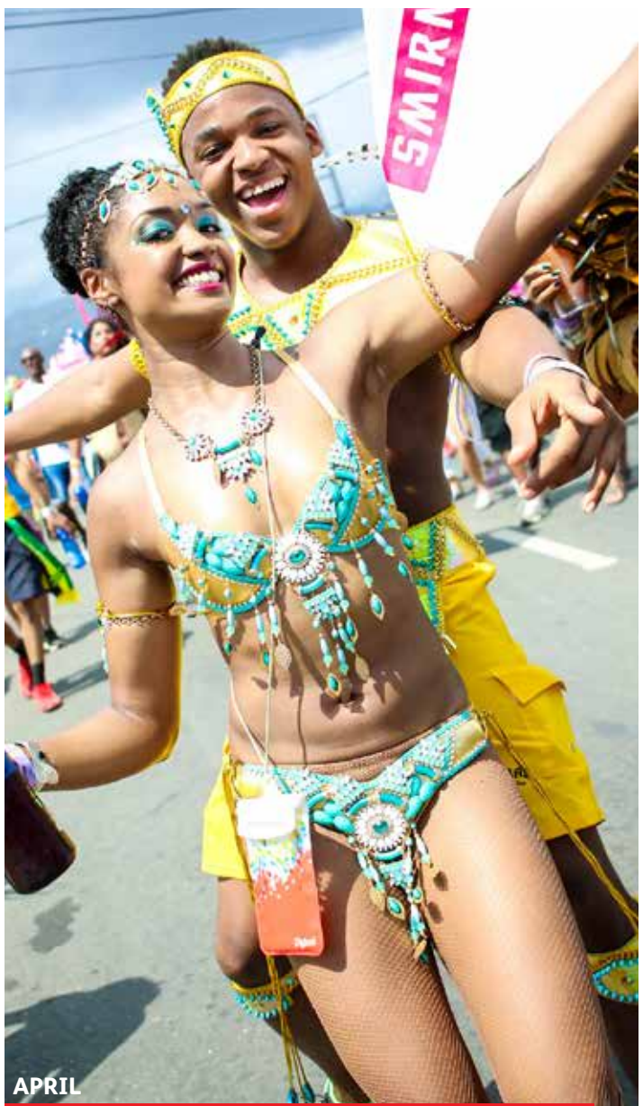
Carnival fans chipping down di road to the sweet sounds of Soca music at Carnival Road March 2016.