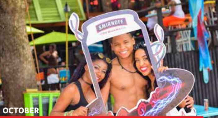
'Shades up, smiles out' – These beach bums are excited to welcome the arrival of Smirnoff Ice Guarana in Jamaica.

'Off they go' - Grand prize winners in the Red Stripe 'Go For Gold' campaign are all smiles as they are feted before making their way to the 2016 Olympic Games in Rio, Brazil.