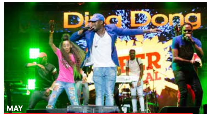
Dancing sensation Ding Dong thrills patrons with a slew of hit songs and dance moves all night at the Red Stripe Beer Festival.