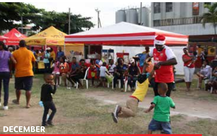
'Food, fun and frolic' – Adults and children alike partake in the festivities at the Red Stripe Christmas Family fun day.